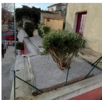
Green spaces at the MPT