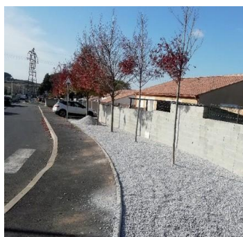
La Grangette housing estate